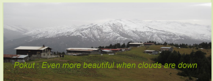
Pokut : Even more beautiful when clouds are down

The nature of Black Sea Region attracts both local and foreign tourists. (Page 4)