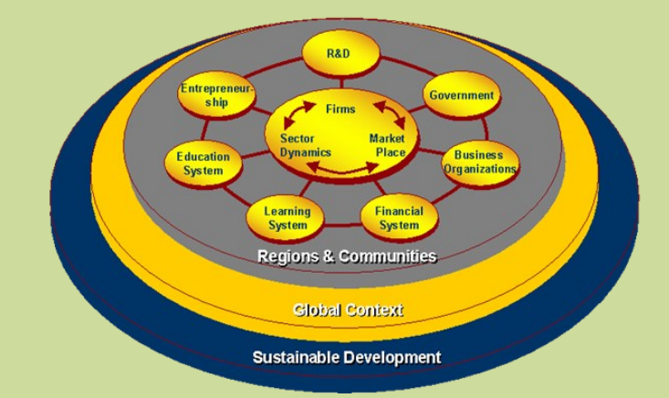
The Local System of Innovation

As we can easily understand from the figure that our final purpose is to obtain sustainable development. For this purpose there are many policy tools available to achieve it. Firms need to establish a supportive framework in their company and also in their business environment to achieve this sustainability . They can start with constituting a new human resource department having intellectual properties.